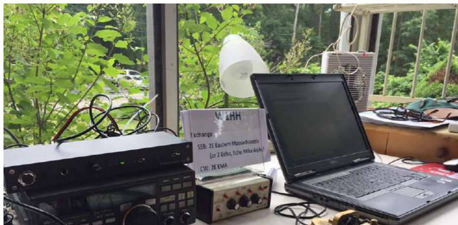
NEWS FOR AND BY BARS MEMBERS